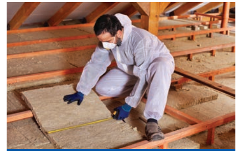
INSULATION Attics • Basements • Windows & Doors