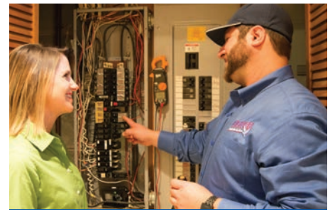
ELECTRICAL Generators • Inspections • Lighting Projects