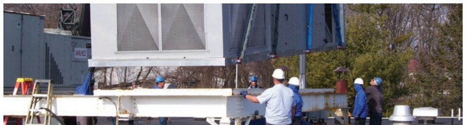
MECHANICAL SERVICES Commercial & Industrial • Maintenance & Repairs • Installation