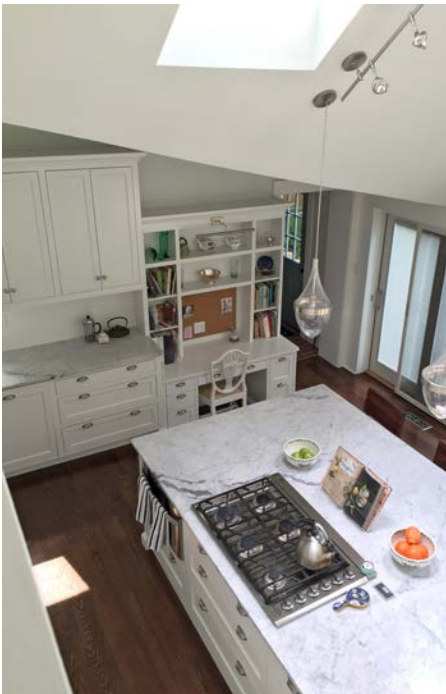
HOME REMODELING Kitchens & Baths • Decks • Basements