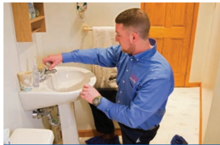
PLUMBING Water Heaters • Fixtures • Water Testing