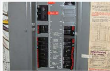
Federal Pacific Electric Company (FPE)