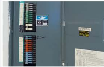
Zinsco® and Zinsco-Sylvania®

Not sure what panel you have? Send us a picture like the top two panels below with the door open to news@oliverhvac.com and we will follow up with you.