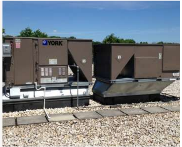
YOUR HVAC BUDGET COST

All for one monthly fixed payment with 0% interest.